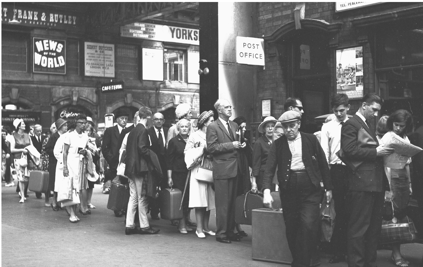
NO NEED TO QUEUE, OLD SPORT—THERE'S PLENTY OF TIPPLES FOR EVERYONE!