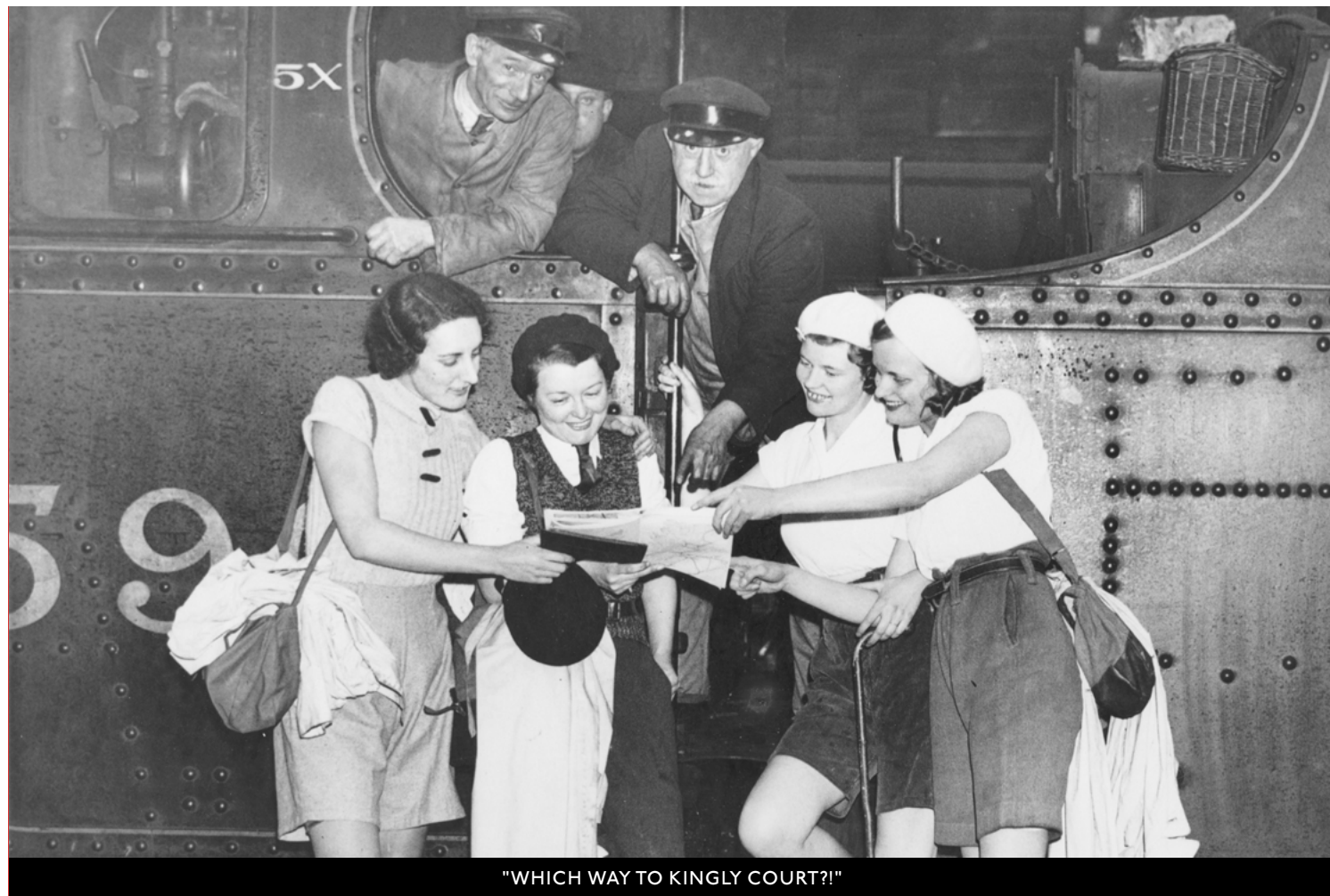
"WHICH WAY TO KINGLY COURT?!"