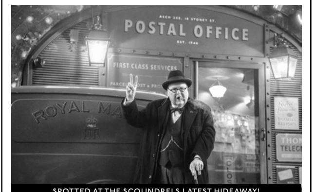
SPOTTED AT THE SCOUNDRELS LATEST HIDEAWAY!

With a pneumatic tube delivering cocktails and seating ranging from cosy booths to repurposed mail sacks, Cahoots Postal Office is set to become Borough's hottest illicit hideaway!