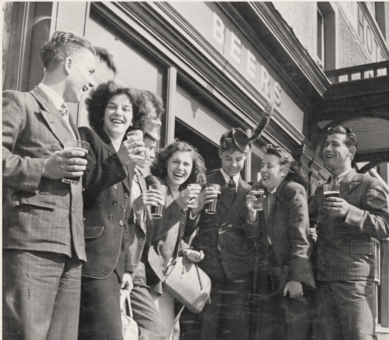
SCOUNDRELS ACROSS LONDON ARE THRILLED TO HEAR CAHOOTS TICKET HALL IS SERVING PINTS!